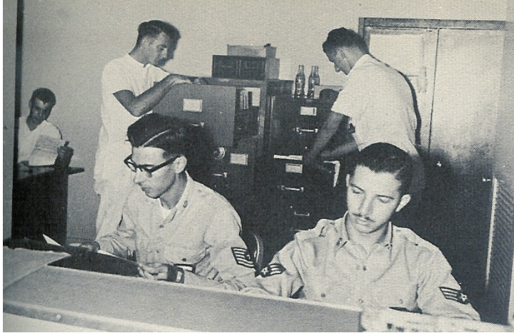
Keeping the records straight in the flight surgeon's office, England AFB, LA, 1955.